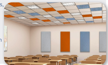
Ceiling: soni COLOR RD / Wall: soni COLOR